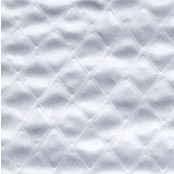
OLD VERSION OF INSULRAP 30-SJ