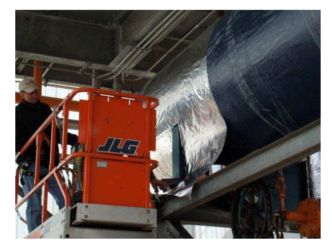
AlumaWrap<sup>™</sup>INSTALLED OVER GeoWrap<sup>™</sup>