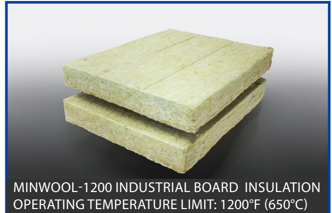
MINWOOL-1200 INDUSTRIAL BOARD INSULATION OPERATING TEMPERATURE LIMIT: 1200°F (650°C)

Standard Thicknesses: 1" to 4" (25 mm to 102 mm). 1½" to 4"(38 mm to 102 mm) industrial boards are available with FSP (Foil Scrim Polyethylene) facings on a made-to-order basis. Minimum order quantities will apply. Other thicknesses may be available upon request.