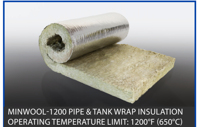
MINWOOL-1200 PIPE & TANK WRAP INSULATION OPERATING TEMPERATURE LIMIT: 1200°F (650°C)

CUSTOMER SERVICE, TECHNICAL & GENERAL INFORMATION (800) 866-3234