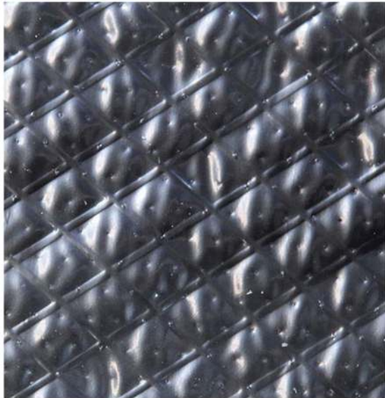
OLD VERSION OF INSULRAP 50-SJ

Insulrap™ 50-SJ-NG is the “Next Generation” of self-healing vapor barrier membranes used on insulated piping in ammonia refrigeration, oil and gas, LNG, cryogenic, tanks and vessels, and chemical processing applications.